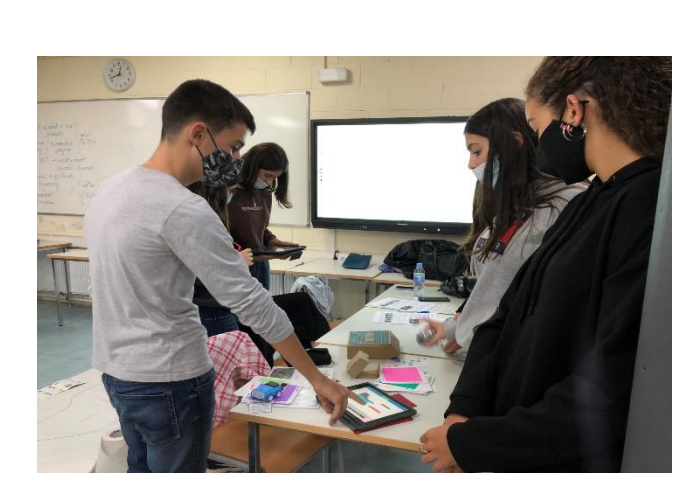
Video and program of one Activities in a Science class of the activities in the (Biology and Ecology) with Sphero Indi.

Together these focus on areas as diverse as Physics, Biology or Social Sciences, and many others. First it can program challenges in relation to the different types of movement; secondly, it can create a circuit of the digestive system, it can also design and create a surface cleaning system in small ponds; and thirdly, help with road safety.