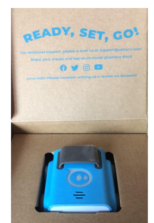
Sphero robots can use: Spark, Bolt and Indi.